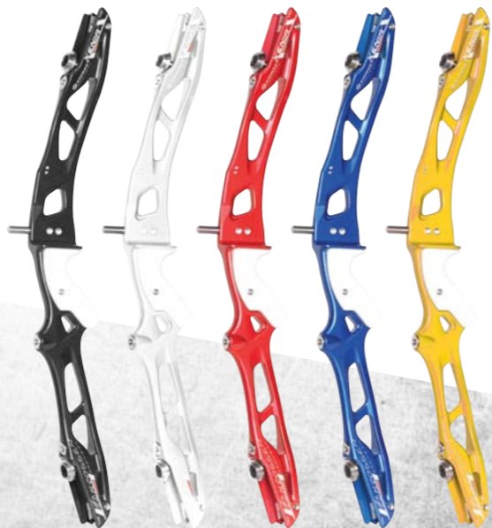
Phantom Black Pola White Fiery Red Cobalt Blue Green